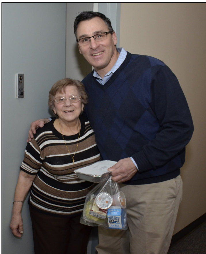
The Mayor of Westwood visits with a client of Pascack Valley Meals on Wheels, which delivers nutritious meals to homebound individuals.

While AIP traditionally has been thought of as avoiding relocation to a nursing home, or staying put in one's own dwelling indefinitely, AIP is increasingly discussed as an umbrella term for a variety of phenomena. For example, AIP can include an older adult living in senior housing, who prefers not to move to a higher level of care even when in need of more supports. It also could include an older couple who downsizes by moving from their long-time home to an apartment building in their same community. Gerontologists increasingly emphasize that AIP should be distinguished from "stuck in place" and that a major aspect of AIP as a broad societal goal is to maintain older adults' residential environments in ways that optimize their health, safety, well-being, connection to others, dignity, and choice.