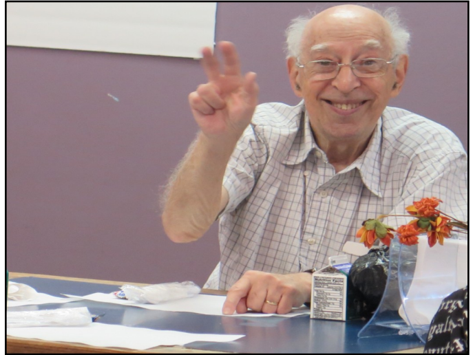
A client smiles at the Bergen Family Center, which provides services such as care management and an adult day center.

In conclusion, while the challenges to AIP in Bergen County—as with other counties—are grave and persistent, both the process and outcome of this project suggests promising possibilities for effective and strategic action for the future. The continued investment of time, energy, and resources of the Henry and Marilyn Taub Foundation (HMTF), along with those of other collaborative and committed stakeholders, indicates that there is great potential for Bergen County to become an even better place for all whose lives and communities are touched by aging and to inspire forward-thinking initiatives around AIP. The information in this report can be used by the HMTF, its growing network of grantees, and others in Bergen County and beyond to better craft efforts concerning AIP as a multi-faceted and critically important goal for individuals, families, and society as a whole.