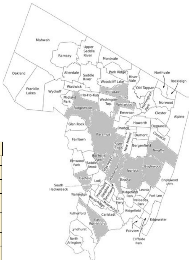
Figure 1. Map of Bergen County with gray areas designating municipalities in which interviews were conducted.

Findings are presented according to four major themes, each addressing a perceived challenge to AIP. Each theme is developed by first presenting why the issue matters for AIP in Bergen County and then by describing participants' perspectives on past, current, and future strategies to address the issue. The report concludes by presenting participants' perspectives on broad directions for strengthening the capacity of organizations to promote AIP.