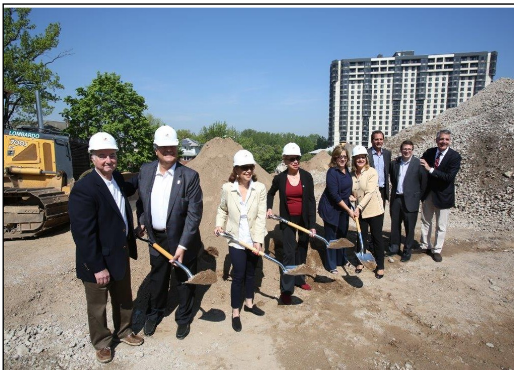
United Way breaks ground on a Very Special Homes community for both seniors and individuals with developmental disabilities.

Subsidized Programs for Home-Delivered Long-Term Services and Supports: Participants described programs that can help older adults avoid having to move for skilled nursing care when they have high levels of clinical need and limited financial resources. Examples of such programs include the Visiting Home-maker Home Health Aide Service of Bergen County's CHEER Program (which involves volunteers providing regular assistance with household activities, such as grocery shopping) and the PEER program through the Bergen County Division of Senior Services (which provides publically subsidized home health services while a person transitions to Medicaid funding). Respondents expressed concerns, however, regarding the long-term availability of these programs, including wait lists for CHEER and the phasing out of the PEER program by the end of 2015. Participants also described in great detail their problems with linking participants to Medicaid Long-Term Services and Supports (MLTSS), especially given the transition