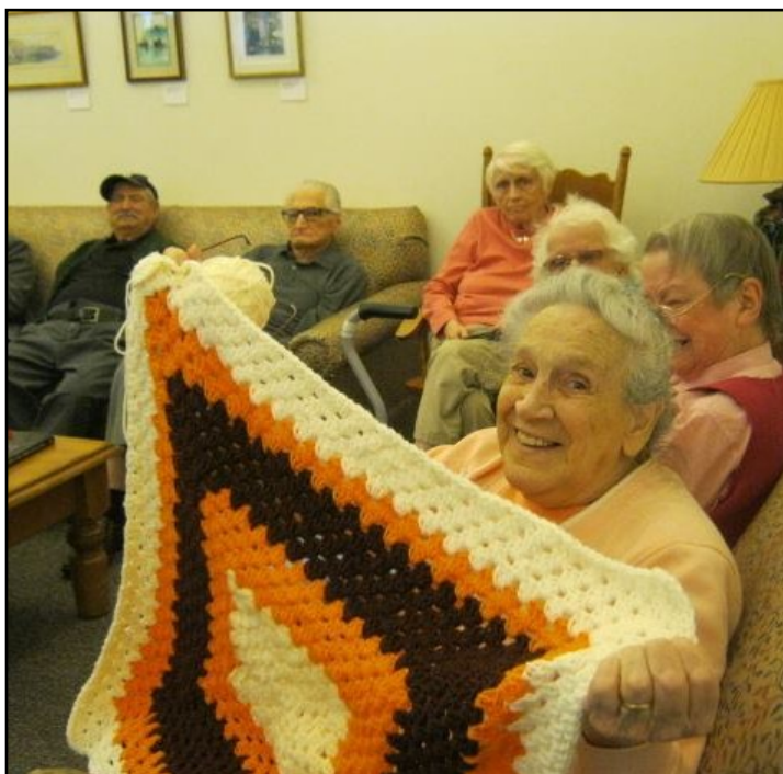
Residents of Bright Side Manor in Teaneck—an affordable assisted living community—provide each other with fellowship.

While there is growing enthusiasm for policies, programs, and services that foster AIP, there also is growing recognition of the grave systems-wide challenges that prevent many individuals and families from doing so. Such challenges include the lack of a comprehensive system of long-term care in the U.S., the design of buildings and neighborhoods that are not amenable to people with disabilities, and institutional barriers to older adults' participation and inclusion within their communities.