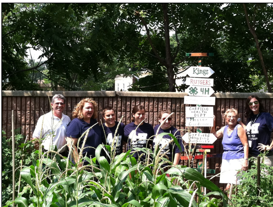
Residents of Garfield convene at a community garden.

Other types of preventive services included Medicaid long-term services and supports, especially in terms of home health services. Although designed for people who already have a high level of functional limitations, the program was perceived as being preventive in keeping clients from having to enter a skilled nursing facility.