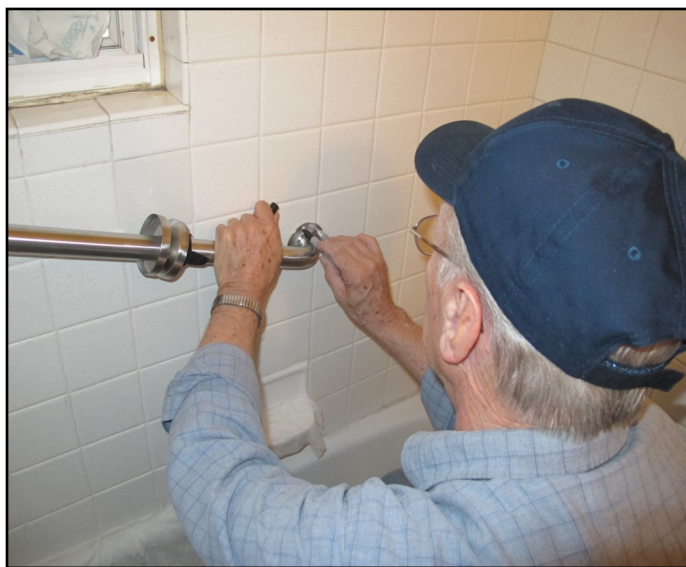
A volunteer from CHORE, which assists clients with minor home repairs, installs a grab bar in a shower.

Nevertheless, there was some recognition that the New Jersey Supreme Court’s recent ruling on municipalities’ obligation to develop affordable housing might lead to a growing number of politics exploring affordable housing projects. Participants also anticipated that as more municipalities successfully complete projects, nearby municipalities might similarly seek opportunities to do the same in their communities as part of a “me too” phenomenon. Some informants described ways in which older adults are an attractive population for new affordable housing, as supporting the development of senior housing is generally viewed as politically positive, and that older adults are perceived as creating less strain on municipal budgets than young families with children because of the costs of supporting public education.